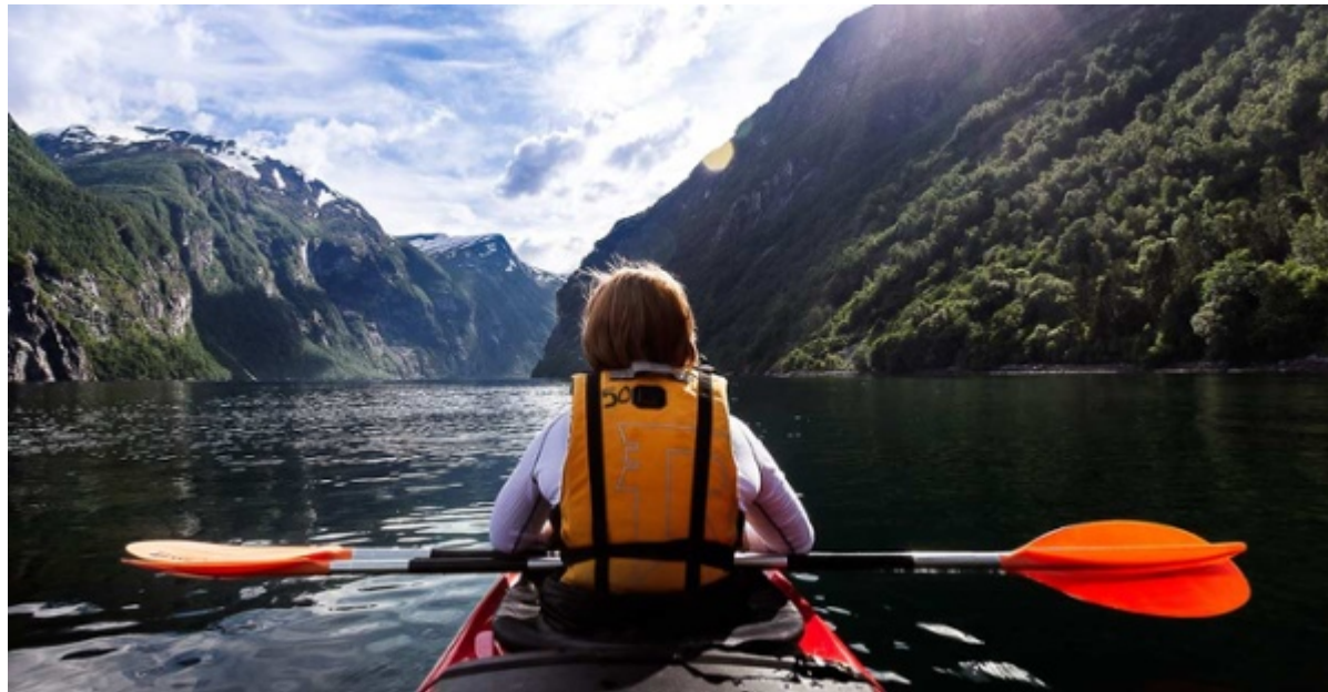
The Nærøysfjord, Norway.