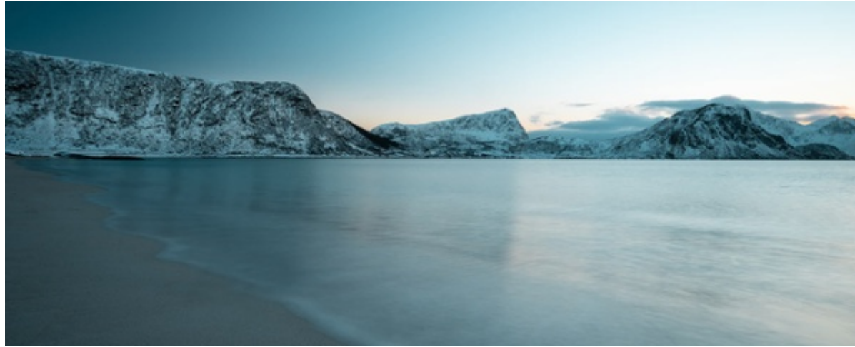
Haukland Beach, Norway.