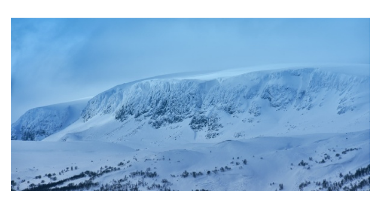
Hallingskarvet National Park.